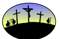
Illustration from lambsongs.co.nz